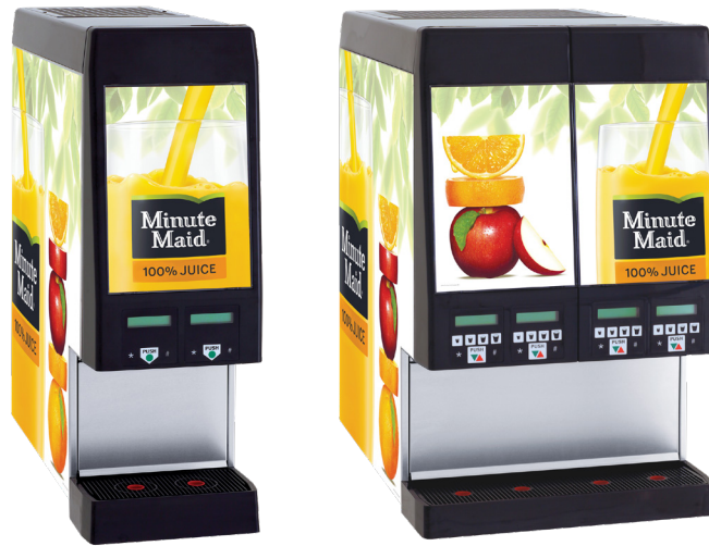
Minute Maid Juicers

Lancer's supplier of the Minute Maid Juicer sanitizing container has discontinued tank delivery.