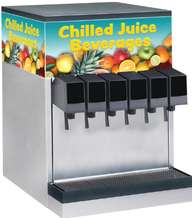
CED 1500 Non Carbonated