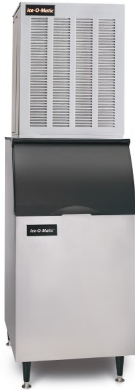
MFIO500 ON B42