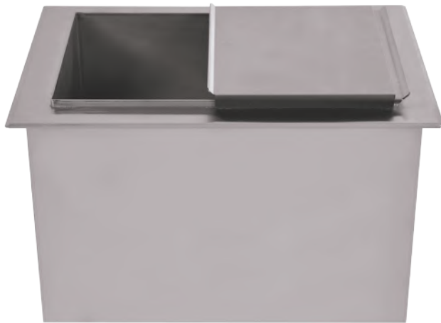
Drop In Ice Chest 22" x 15"