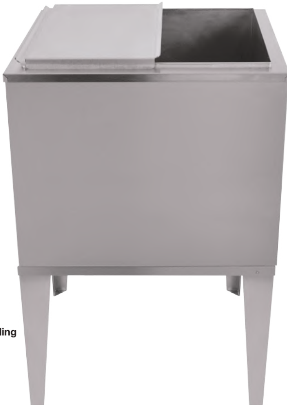
Free Standing Ice Chest 23" x 21"

Lancer's IC 400 Ice Chests are designed using the highest quality materials and proven technology providing our customers with consistent drink quality.