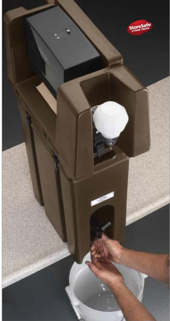
Shown with 500LCD Camtainer.