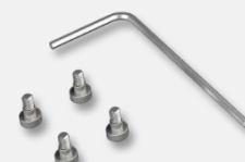
4ea. "Shoulder" screws 1ea. Hex Wrench