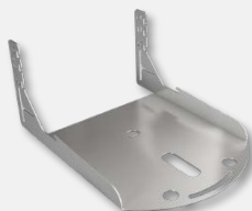
1ea. Adjustable Stainless Steel Shelf