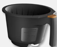
1ea. 13" x 5.5" Brew Basket with Brown Insert