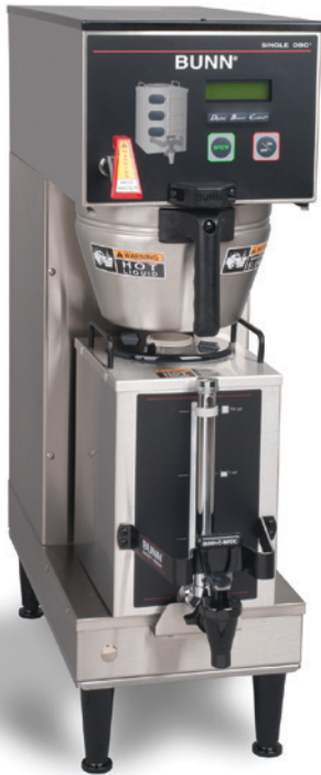
Single GPR DBC with 1.5 gallon GPR Server

Dimensions: 29.6 H x 9.2" W x 20" D (75.2cm H x 23.4cm W x 50.8cm D)