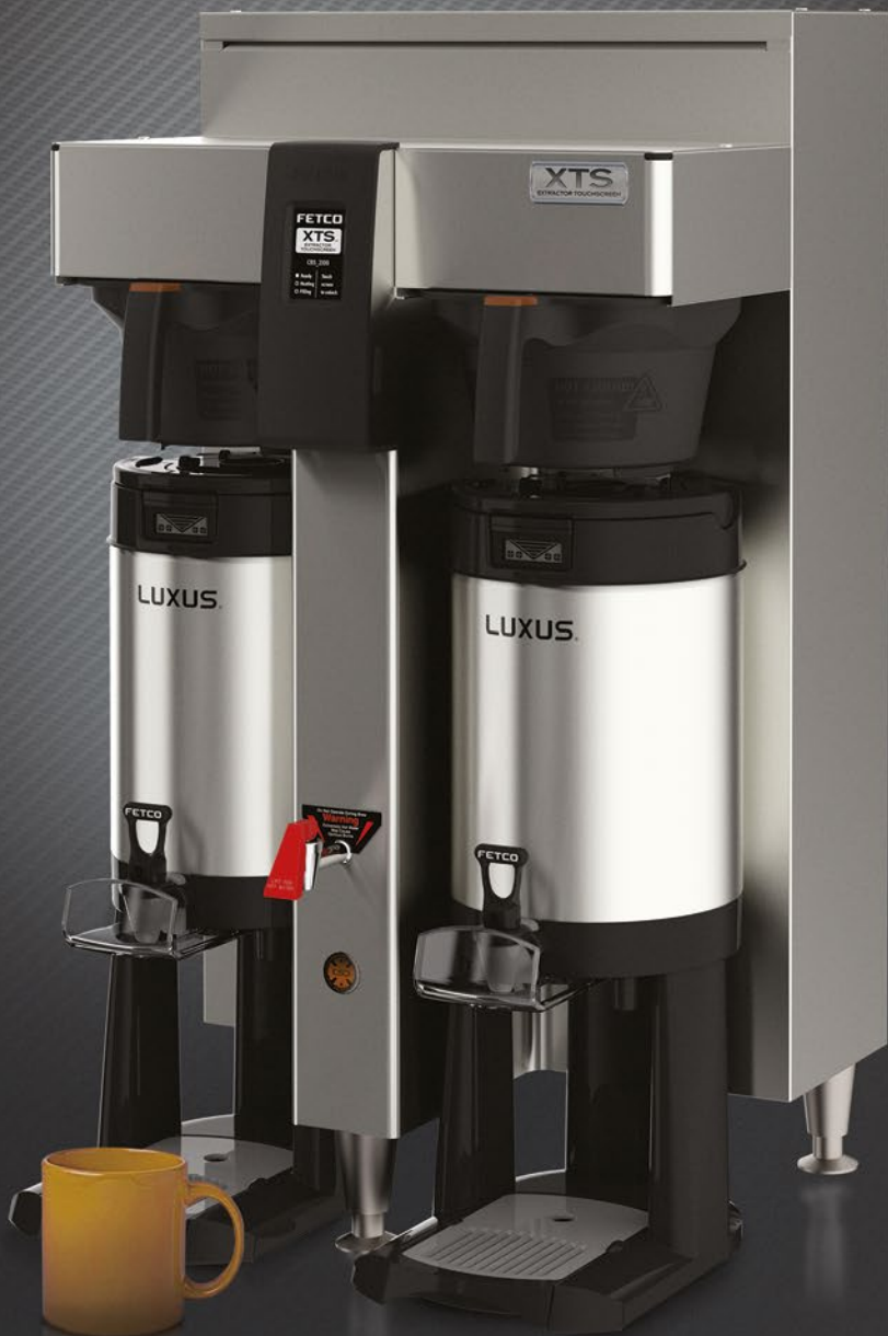
CBS-2152-2GXTS Twin Station Brewer*

* Shown with L4D-20 Luxus® Dispenser (sold separately)