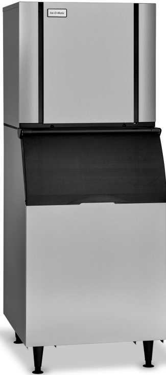
CIMO836 ON B55