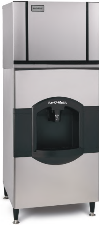
CD40030 with CIMO330