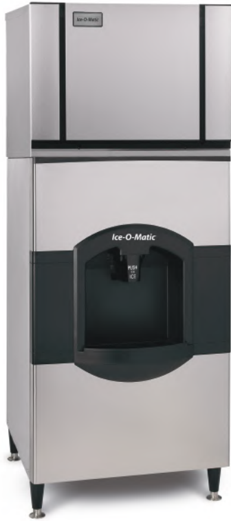
CD40030 with CIMO330