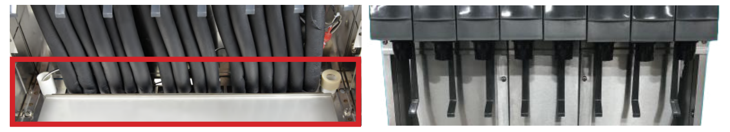
Deep Well Coldplate/Liner

Improved Modular Stainless Towers for High Performance and Bevariety Dispensers (Hard Plumbed)