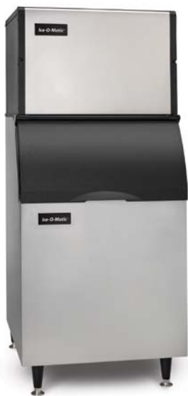
ICE 500 ON B55

Ice-O-Matic modular cubers are designed to provide the highest reliability, with carefree operation and maintenance. They produce pure, crystal-clear ice for the most demanding foodservice and hospitality needs. Half and full cube configurations are available.